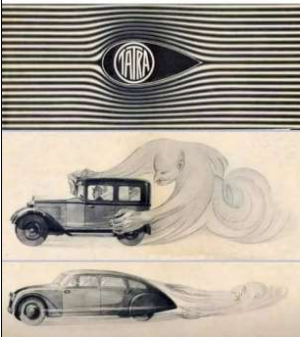
(Thanks, Steve Vied)

Car manufacturer Tatra explaining aerodynamics (1934) in a simple way for anyone to understand. (Image originally extracted from Tatra T77 brochure. Photo credit: Tatra - The Legacy of Hans Ledwinka).