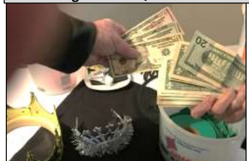
Counting 50/50 cash!